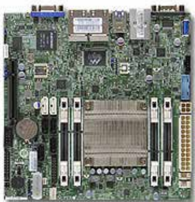
Rangeley, Low Power Communication Intel® QuickAssist Technology